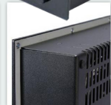
Metal Panel Mount