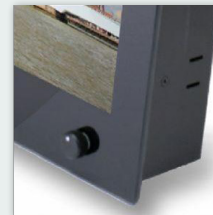
Glass Panel Mount